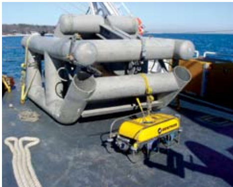
A Stingray ROV system was used to retrieve a 4,000 lb bottom-moored data collection platform.