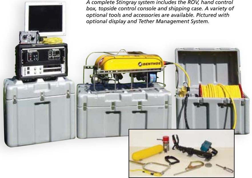
A complete Stingray system includes the ROV, hand control box, topside control console and shipping case. A variety of optional tools and accessories are available. Pictured with optional display and Tether Management System.