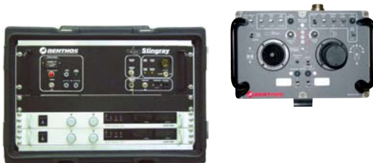
Stingray topside control console and hand control box.

The handbox connects to the surface control unit with the handbox extension cable and is used to control all of the Stingray's functions. It is packaged in a rugged, cast aluminum housing with drop protectors and includes a comfortable padded neck strap.