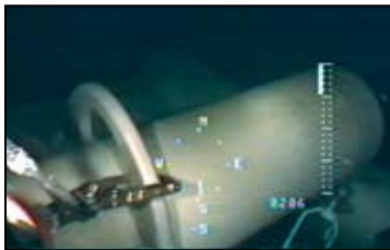
The Stingray was outfitted with a hooking mechanism to attach a line for the top bail of the platform which was then hauled to the surface.